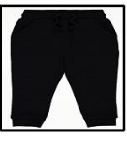
<u>George@ASDA</u> Black joggers £4.00