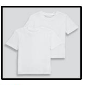
Matalan White t-shirts (x2) £4.00