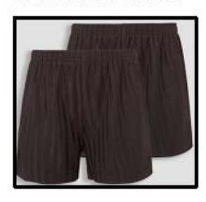
Sainsbury's Black shorts £3.00

Hoodies with the school logo are available to order from Border Embroideries.