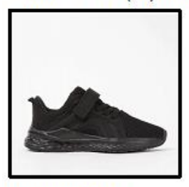
<u>George@ASDA</u> Black trainers £9.00