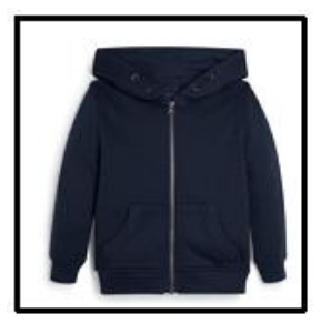
<u>Primark</u> Black hoodie £4.00