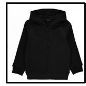
<u>George@ASDA</u> Black hoodie £4.00