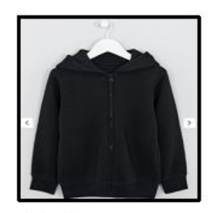
<u>Matalan</u> Black hoodie £5.00