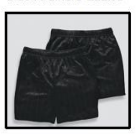
<u>Matalan</u> Black shorts £4.00