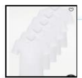
George@ASDA White polo (x5) £6.00