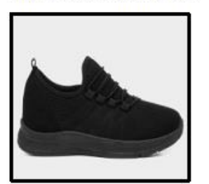
Shoe Zone Black trainers £12.99