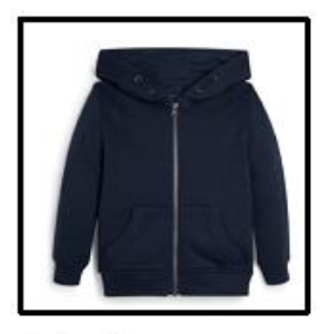
Primark Black hoodie £4.00