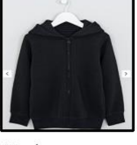
Black hoodie £5.00