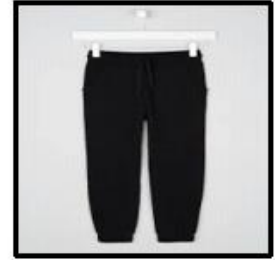
worn for indoor PE. Children should wear these under shorts.