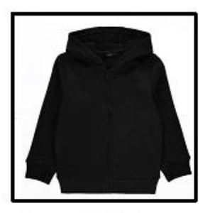
George@ASDA Black hoodie £4.00