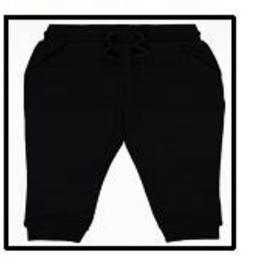
George@ASDA Black joggers £4.00